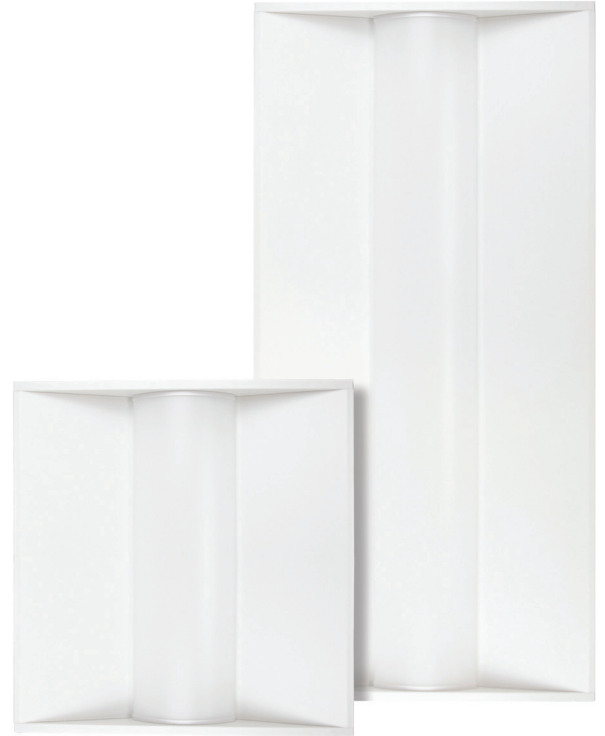
2x2 and 2x4 Models